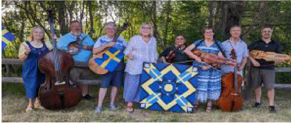
Musicians gather every year at the beginning and end of the season to celebrate Swedish music