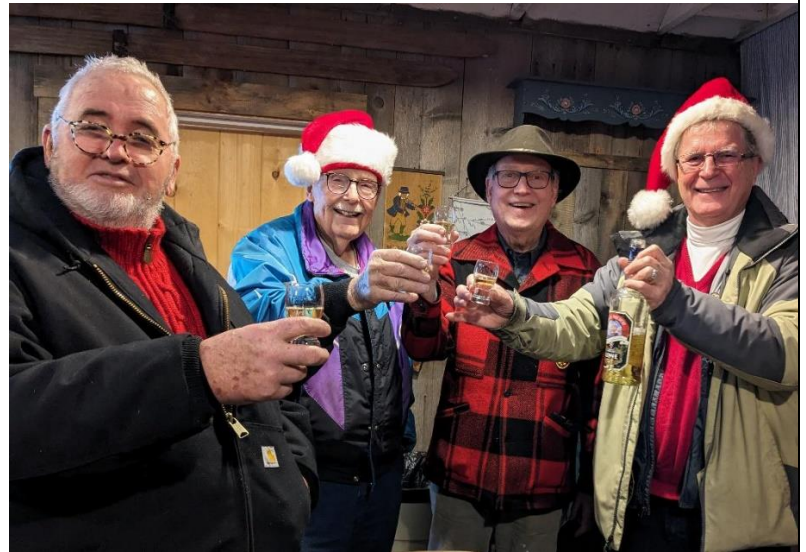
An aquavit toast to the year!