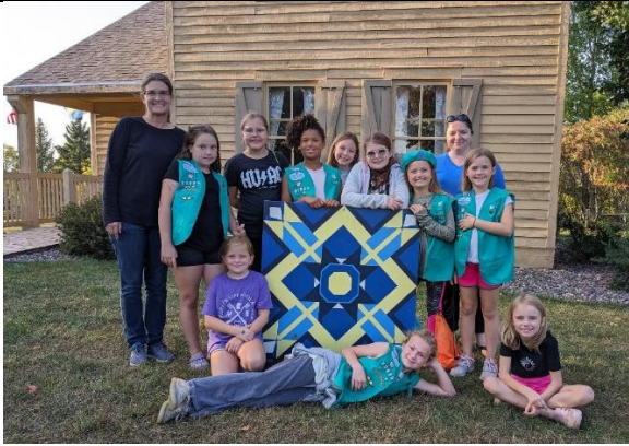
CL 4 th Grade Girl Scout Troop visited on September 19 th .