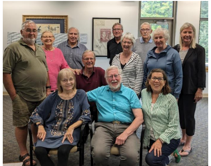
Additional board members are welcome if you'd like to join this group!