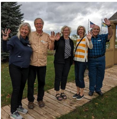
Sending the 2 nd graders on their way!