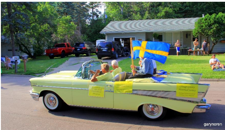
Karl Oskar Days parade